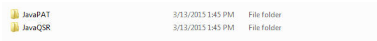
Figure 1-2 Java Samples File Structure

Extract out the files from the "JavaSamples.zip".